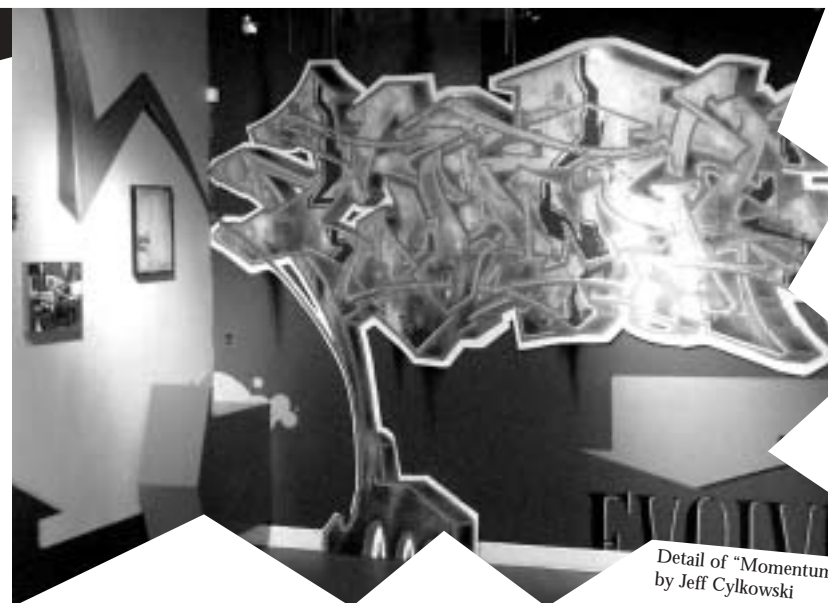
Detail of "Momentum" installation by Jeff Cylkowski