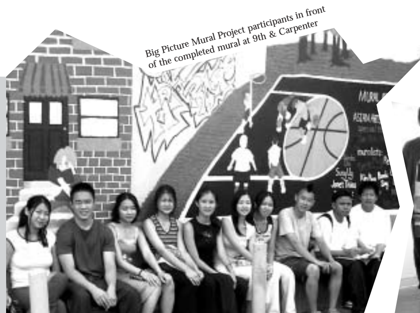
Big Picture Mural Project participants in front of the completed mural at 9th & Carpenter