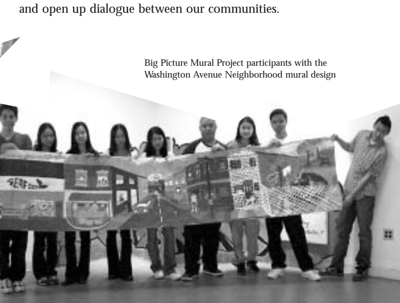
Big Picture Mural Project participants with the Washington Avenue Neighborhood mural design